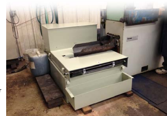
Göckel and Reform Knife Grinders