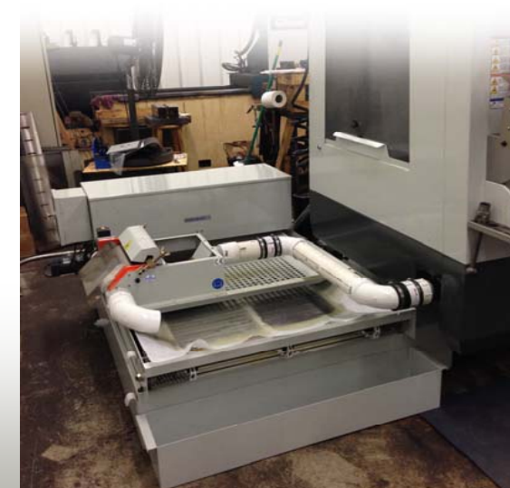
BFμ-60M / HAAS VF2