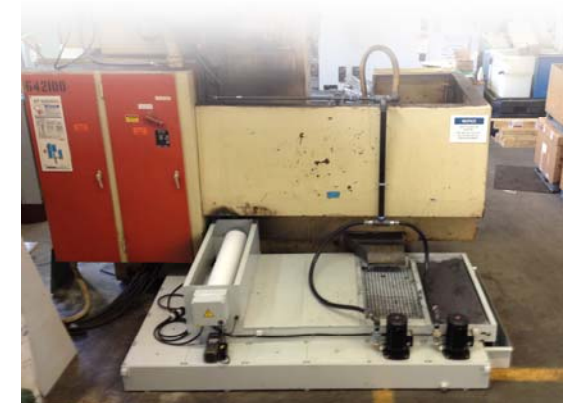
BFμ-95s / 42" Mattison Grinder

All models will accept our standard media density 50μ - 30μ - 15μ Other specifications available